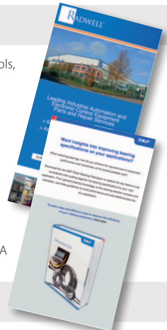
Example of E-Casts

e-Cast rate: 1k – £395 2-5k – £325 / 1,000 6-10k – £275 / 1000 10k+ – £225 / 1000 Lease: POA