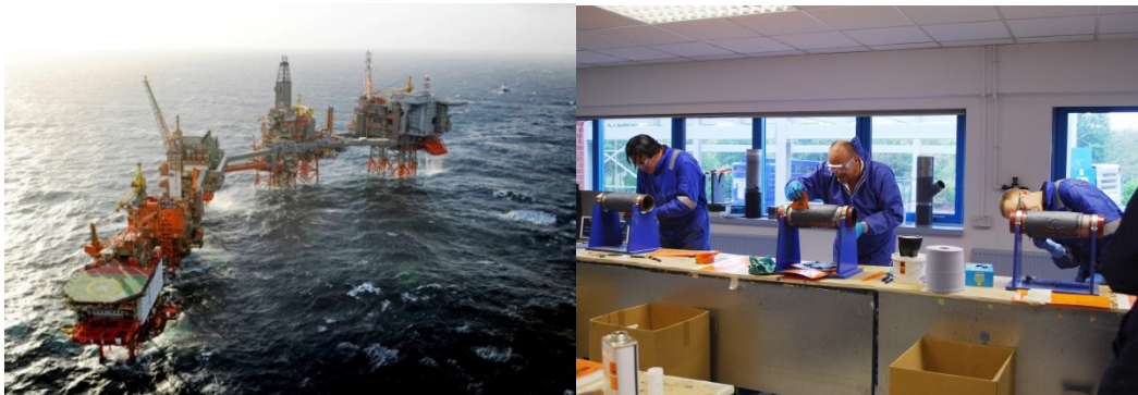
[Belzona SuperWrap II can be used in a variety of application areas] [Theoretical and practical training available at Belzona head offices]

This allows for more hands on time in an extended practical session, further improving the skills of the installer. The installer training course is a pass or fail course, so only the highest skilled installers are allowed to apply Belzona SuperWrap II, ensuring the product is applied in the way it was intended thus maintaining our high standards of application.