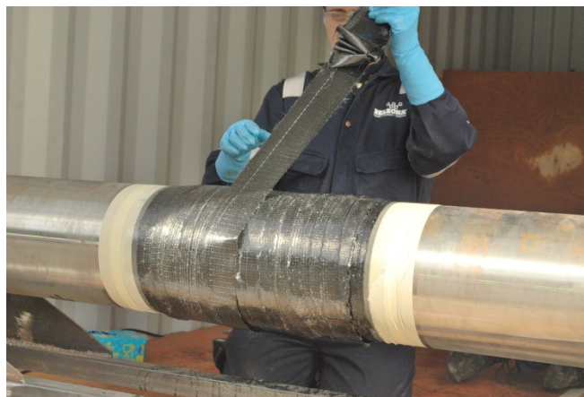
[Pressurised to target pressure of 39.2MPa, pressure taken 5% over, no failure seen, but substrate began to yield]

The repair was applied to specification and the pipe was then pressurised up to 39.2MPa, without failure, demonstrating that the Belzona SuperWrap II had performed as designed. Pressure was then increased to determine where a yielding would occur – in the repair or in the original pipe. At around 42MPa, the pipe clearly yielded, outside of the repair area. This demonstrated that not only had the wrap returned the pipe to its original strength, it had also made the defect area stronger than the original pipe section.