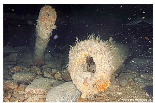
A breech loading 6-inch MK VII gun protruding from its casemate, part of the Hampshire's secondary armament, with a possible three-pounder gun to the left.