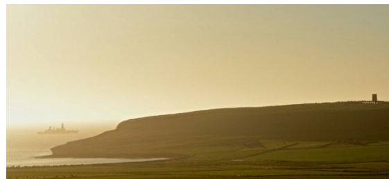
A battleship marks the point where HMS Hampshire sank 100 years ago and the tower that commemorates the lives lost can be seen on Marwick Head, Orkney.